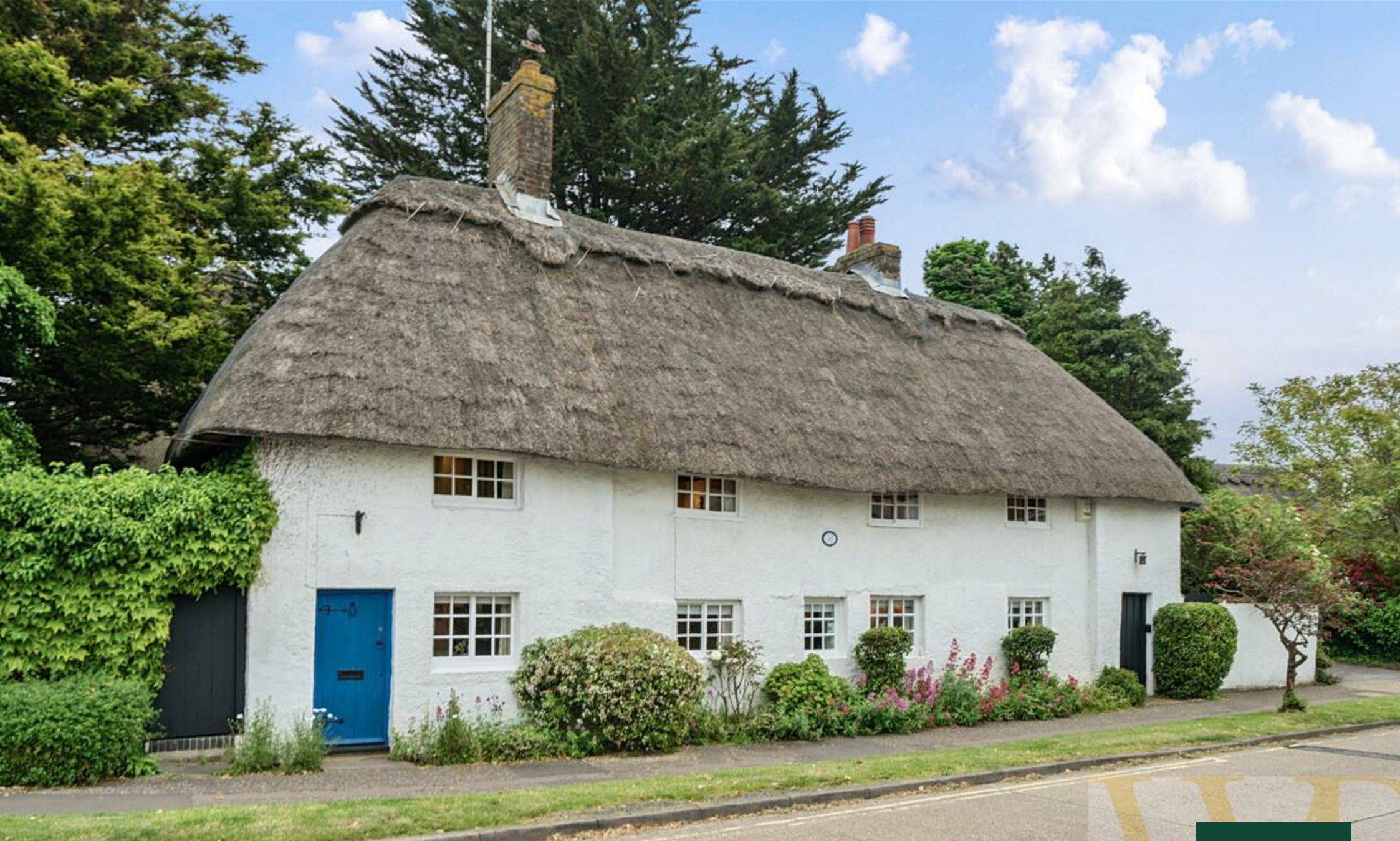
Thatch Cottage, 110 Connaught Avenue | | Shoreham-By-Sea BN14 9WD